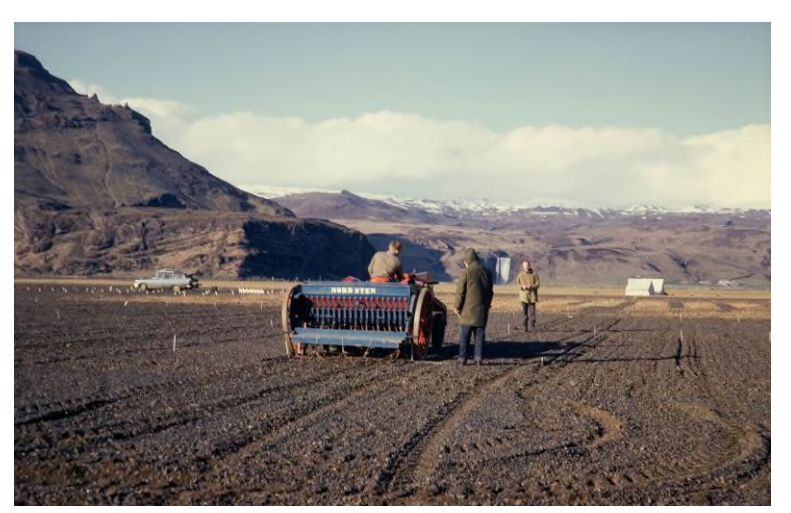
Figure 14. Sowing time test on Skógasandur 8 April 1963. Tent base and Skógafoss in background right. -17^{\circ} and orkan following day. Einar Erlendsson facing camera. Author's Plymouth in background.

The cereal research in 1963 started in a remarkable way. The winter had been mild and in March there was no frost in the ground in the eroded sand lands in south Iceland. The late-winter weather had been sunny for days with temperatures of 8-10°C. It was therefore decided to conduct trials comparing the