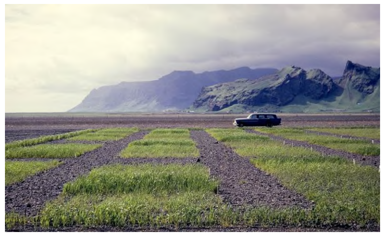
Figure 16. Trial with barley lines and fertilizer rates on Skogasandur 1962.