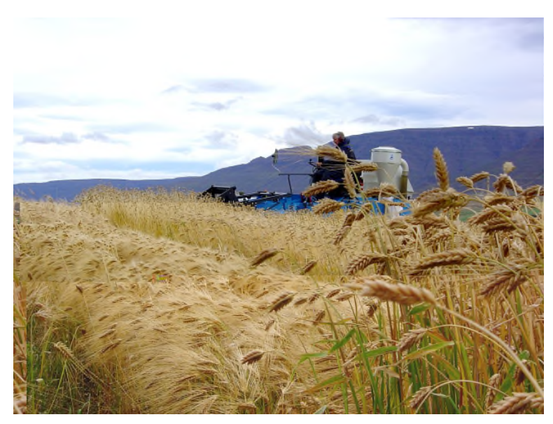
Figure 20 . Father and son in Eyjafjörður 2004. Right: Cv. Arve, 6-row, tall and early maturing. Left: the progeny after a cross with Danish malting barley, 6-row and short with a stiff straw.

One ruefully thinks back to the 1960s, wishing that these new cultivars had been available. Then again: the severe little "ice age", which developed in that decade, probably would not have allowed any of these varieties to succeed. The present success is certainly to