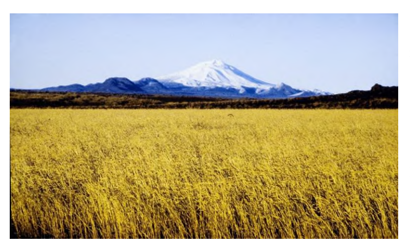
Figure 11. Barley field, variety Jøtun, with volcano Hekla in background 1961.

agricultural advisers in the spring of 1963 concluded the following: "The new grain growing activities started in 1961 and we now have experience from two seasons. The results were acceptable in 1961 and poor in 1962. The summer of 1962 was difficult and not suitable grain production. for Spring seedings were late, the spring was cold, the summer acceptable but serious frosts in August and September stopped the ripening process and heavy storms in September delayed the harvest and caused damages in the fields. The worst experimental results were in north and north-east Iceland. Poor results in north-west and west Iceland and also in south Iceland as far east as Eyjafjöll, just east of Sámsstadir. From there east to Hornafjörður the results were acceptable, 2 t ha<sup>-1</sup> or more". The highest yields were measured at Hvammur, Langadal in the north west and at Teigingarlækur in the south east. On the eroded sands in south Iceland, the old Faroe variety Sigur had the highest yield,