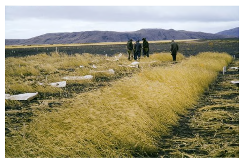
Figure 15. Harvesting a cereal trial at Gunnarsholt 1962.

effects of sowing time on grain maturity and yield at Skógasandur. Detailed plans were made with three sowing dates, on 12 March, 10 April and 13 May, using one variety each of barley, oats and seed rape. When it came to the 2^{nd} planting date in April, the expedition reaching Skógasandur on 8 April found that the plants sown on 12 March had grown to 5 cm. The following day was spent seeding a few varietal testing and fertilizer experiments, the 2^{nd} sowing date treatment being planned for 10 April. The team had erected two tents on the sand and had one station wagon loaded down with seeders. fertilizer spreaders, seed and fertilizer bags in addition to the four field staff. The day had been pleasant, blue skies and the temperature around 8°C. After a hard day's work, we sat in one of the tents around 7 pm to have dinner, when out of that blue sky, a violent storm slammed into the tents. We managed to get a hold of the tent we were in but the other tent, where the supplies and some equipment were stored, simply took off into the yonder.