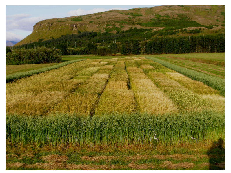
Figure 18 . Comparison of Icelandic breeding lines and promising foreign cultivars of 2-row barley at Korpa 2014.