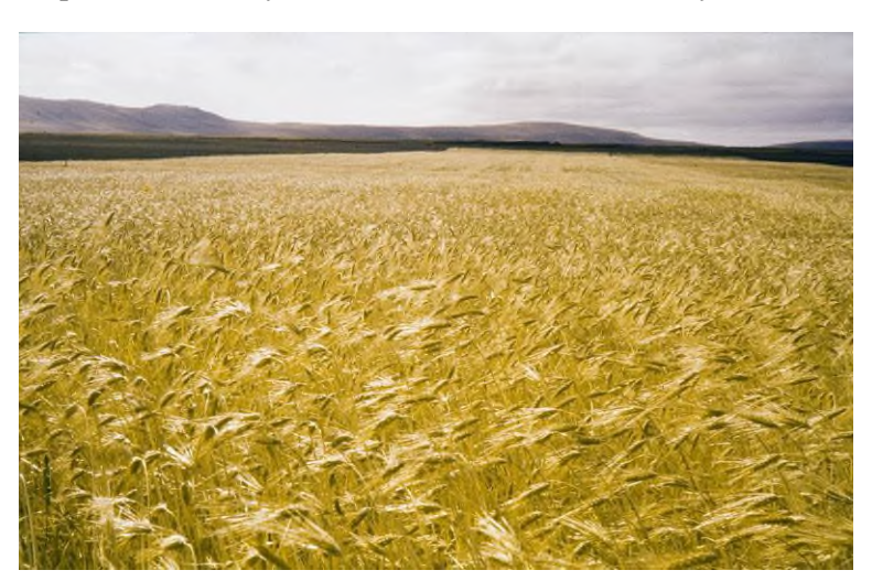
Figure 12. Edda barley field at Gunnarsholt 1962.

The very poor outcome from grain growing in Iceland in 1962 resulted