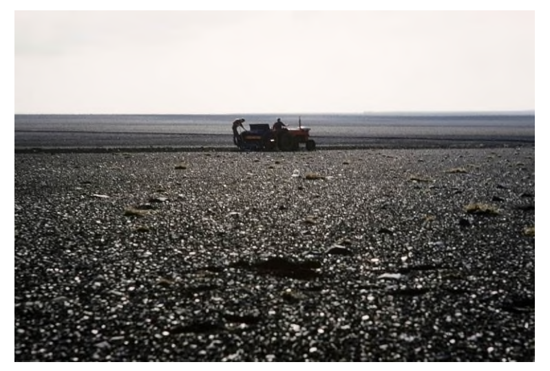
Figure 5 . Seeding a barley field in the sand "soil" at Gunnarsholt 1962.

bought all the necessary equipment for small grain growing, including a combine and a drier to produce feed grain for their livestock. The author drew up the plans for them, ordered barley seed of the varieties thought to be best adapted to the area and the seeds were planted in the spring of 1962. The Minister of Agriculture at the time, Mr. Ingolfur Jónsson, stated in the Althing that grain growing in Iceland was still a risky business and without extensive research work, primarily to develop better adapted grain varieties, it would not become a dependable farming enterprise in Iceland. This was most unusual for a politician to say in any country. In 1960 the Government had established the firm Feed and Seed at Gunnarsholt with the task of producing grass pellets, forage grass seeds and barley on eroded land reclaimed by the Soil Conservation Service. The firm purchased seeding equipment, combines and a grain drier. The Government also provided funds to the University of Iceland for starting the research and breeding activities. The Minister appointed