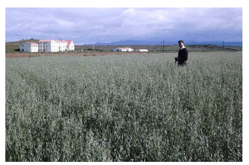
Figure 6. Jónas Jónsson in an oat field at Gunnarsholt 1963.

It is interesting to trace the history of grain growing in the 1960s through reports and advice on barley farming which were published in the Farmers' Handbook (Handbók Bænda) for that period. In 1960 there was no special reference to grain production and all the emphasis was given to forage and horticultural production. In 1961, however, Klemenz Kr. Kristjánsson wrote a short chapter on cereal growing (pp. 128-130) followed by two chapters by the present author in 1962 (pp. 102-107) and 1963 (pp. 138-142). In 1964 there was no special reference to grain growing but three of the experimental stations reported that some trials were carried out, all with poor or no success due to bad weather. In 1965 there is no special entry on grain growing in the Handbook but two experimental