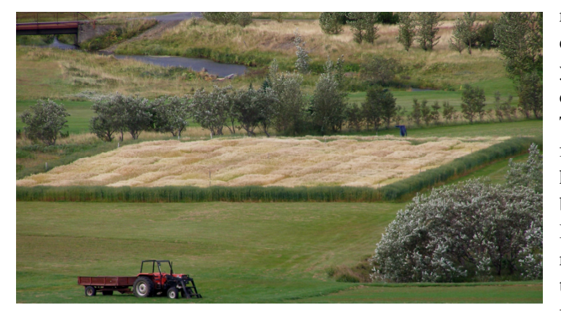
Figure 19 . Comparison of Icelandic breeding lines and promising foreign cultivars of 6-row barley at Korpa 2014.

barley variety Diamand, bred by Czechoslovakian breeders to brewing barley production in of whom I was Europe, all associated with during my former U.N. activities. Similar results as those in Iceland have been achieved recently by Peruvian breeders by using induced mutations to develop which barley varieties give outstanding yields in many areas of the Andes, in some areas over 4.000 m above sea level.