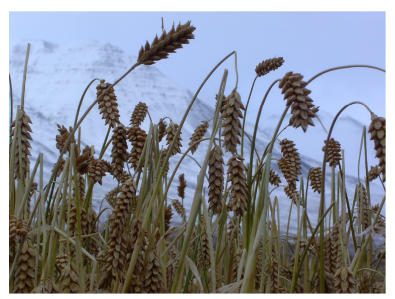
Figure 21. Barley growing by snowy mountains at Möðruvellir in autumn 2005.