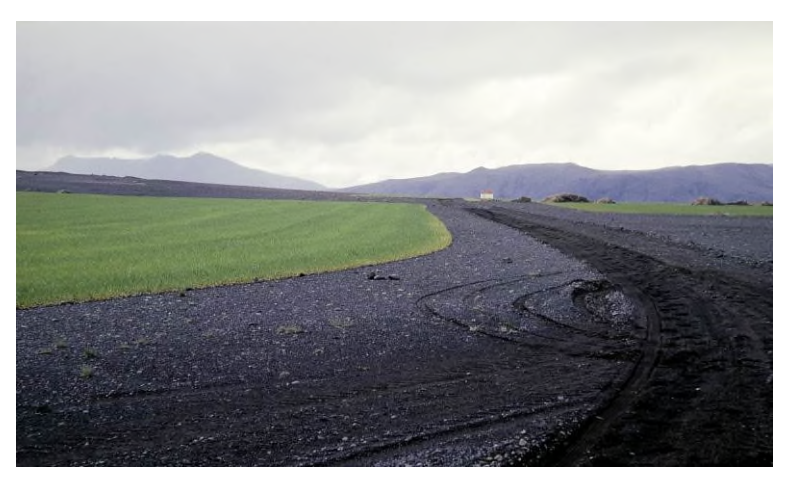
Figure 13. Wheat field, 0.3 ha, Gunnarsholt 1962. Norwegian cultivar Norrøna.